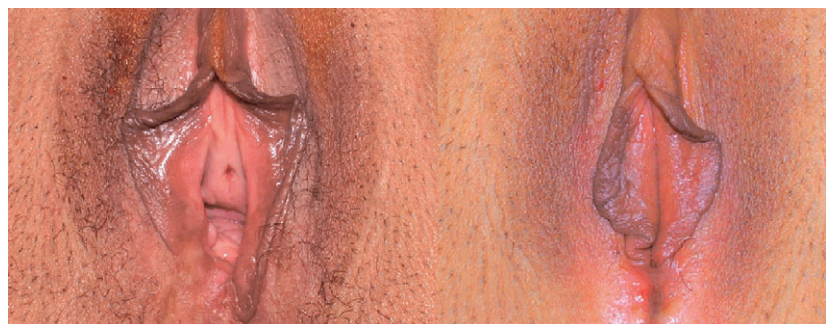
Figure 5 Pre-/post-op perineoplasty.

Alter [33], in a study of 407 LP patients from 2005 to –2007, found that 93% of respondents to a retrospective questionnaire gave “improvement of self-esteem,” 71% gave “improvement of sex life,” and 95% gave “diminishment of discomfort” as primary reasons for surgery. Miklos and Moore [20], in their 2008 study of 131 LP patients, noted that 37% (49/131) patients listed “strictly aesthetic” reasons for their surgery, 32% (42/131) listed “strictly functional,” and 31% (40/131) listed a combination of the two factors. They also found “little outside influence” in patient’s rationale for and decision to undergo surgery. Rouzier et al. [8], in a study of 163 patients undergoing LP